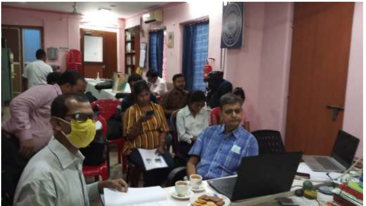
Pic. Project Viva Voce on 4 th August, 2022

Valediction Program on “One Year Diploma Course” held on 5 th August, 2022 at IIMM Hall.