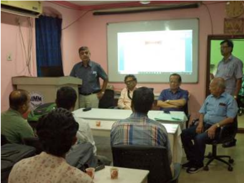
10.01.2023 GDMM & PGDMM project viva held at IIMM Hall-