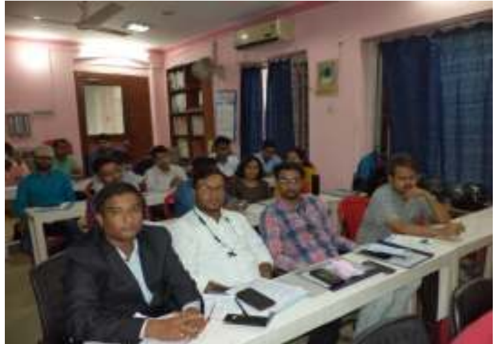
Pic. Inauguration of GDMM July, 2022 Session