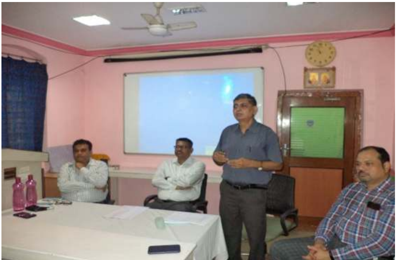
Pic. Inauguration of GDMM July, 2022 Session