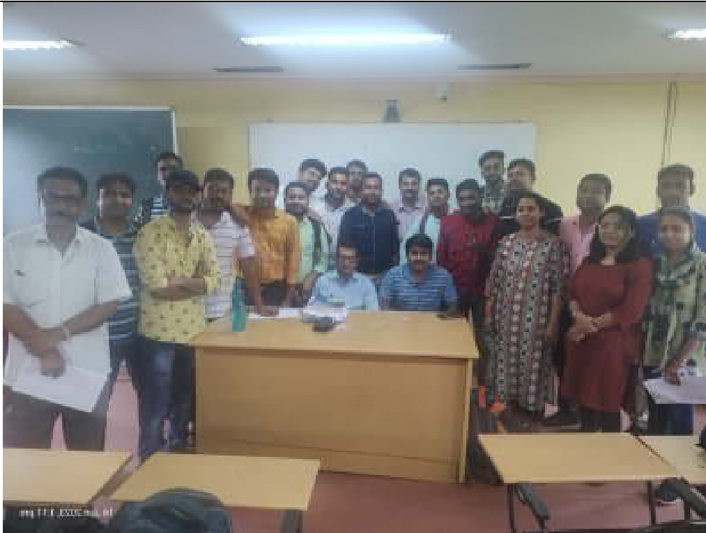
June 2023 Examination